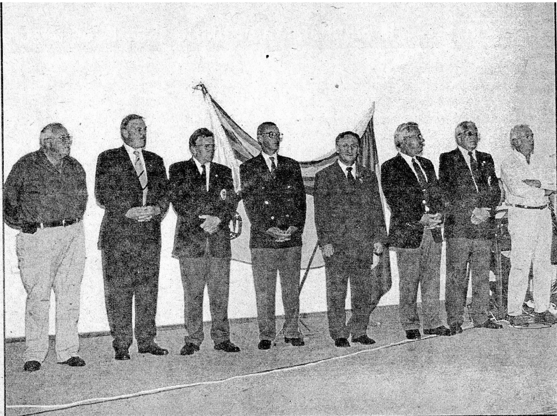
Officialii concursului, prezentați la deschiderea oficială de la Primăria Pitești.