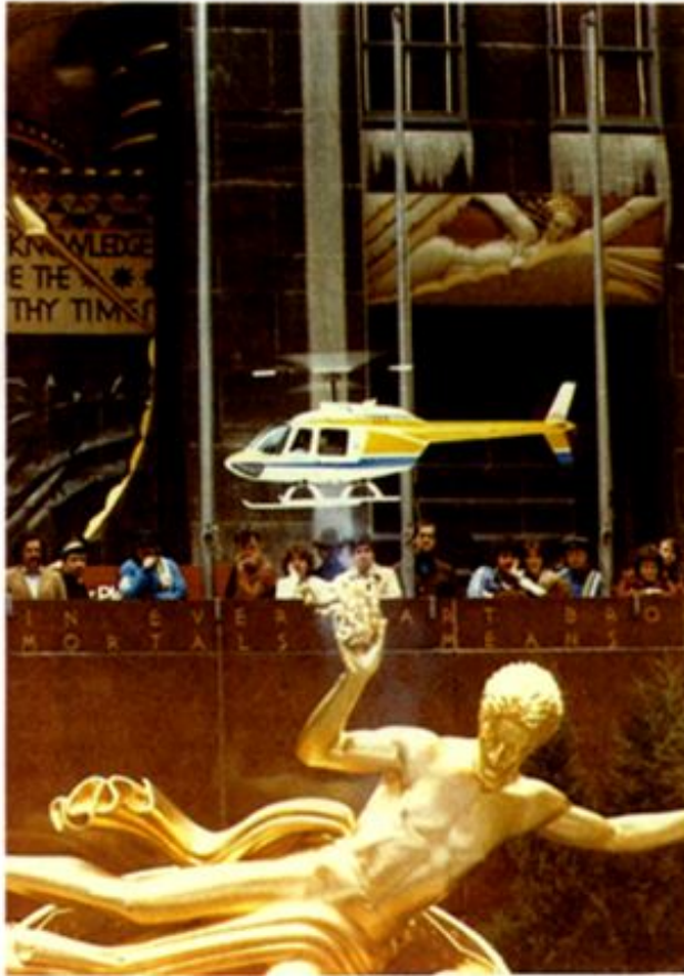
My Jet Ranger hovering over Prometheus at Rockefeller Center ice skating rink - Model Aviation Day 5 - 1980