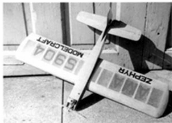
1/2A scratch-built CL stunt plane with Ailyn Sky Fury .049 engine - 1954