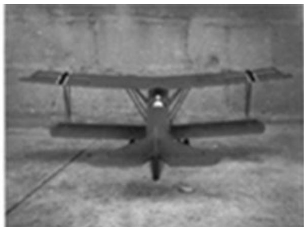
Scratch-built Fokker D.VII semi-scale 1/2A FF - 1955