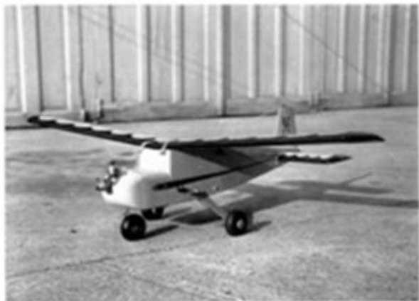
Original "Shookywukms" rudder only S/N escapement R/C model with Webra .09 diesel engine - 1956