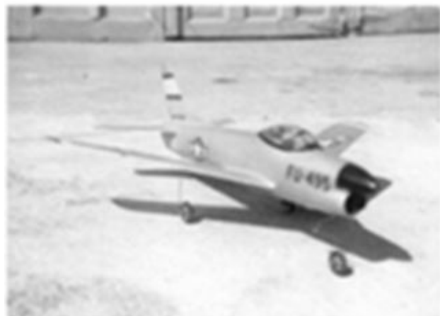
Top-Flite Jetex 50 powered F-85A FF model - 1956