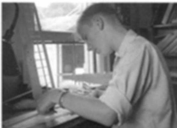
Building a Berkeley DeHaviland Beaver with Berkeley Aerobal R/C & S/N escapement - 1956