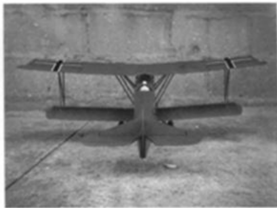
Scratch-built Fokker D.VII semi-scale 1/2A FF - 1955