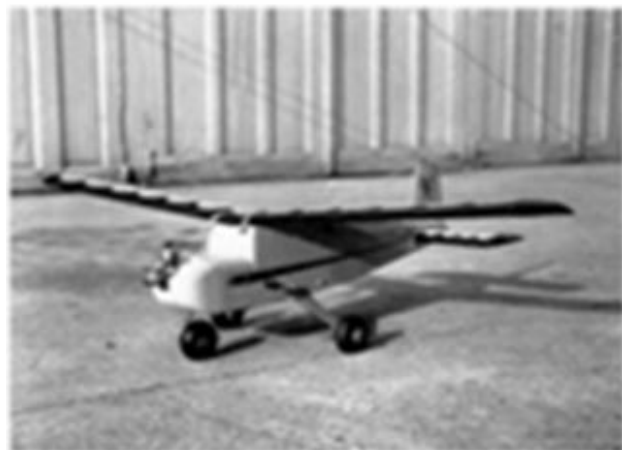
Original "Shockywakins" rudder-only S/N escapement R/C model with Weibra .09 C/O Diesel engine - 1956