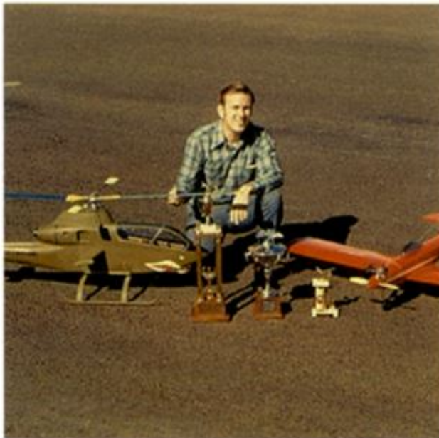
Cobra and Kwik-Fli pattern ship - 1st in Helis, Eveready Grand Champion & 5th place pattern trophies - 1972 LIDS meet