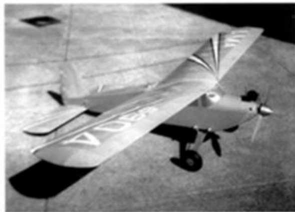
DeBolt Rebel single channel compound escapement with Bantam .19 engine - 1956