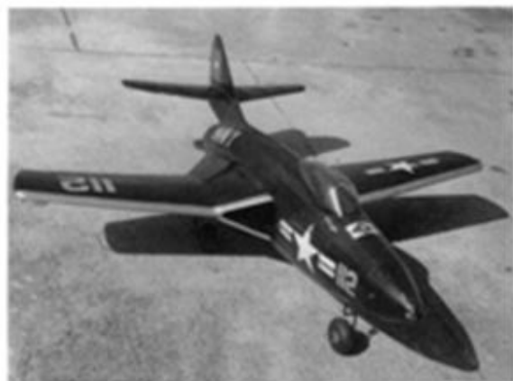
Scratch-built ducted fan semi-scale Grumman F6F Panther FF with TD .049 engine - 1956