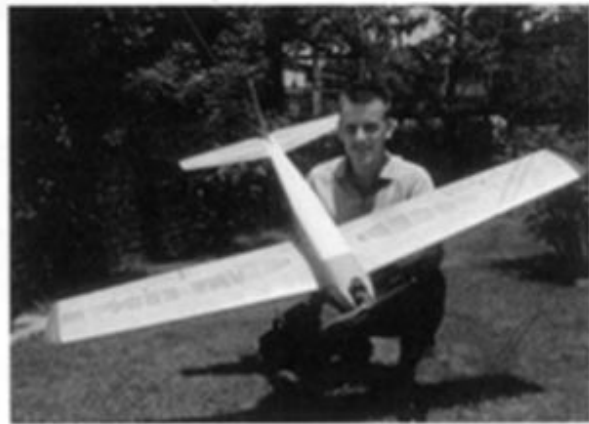
Top Flite Orion with K&B .45 engine and home built 8-channel reed R/C system • Bonner servos - 1960